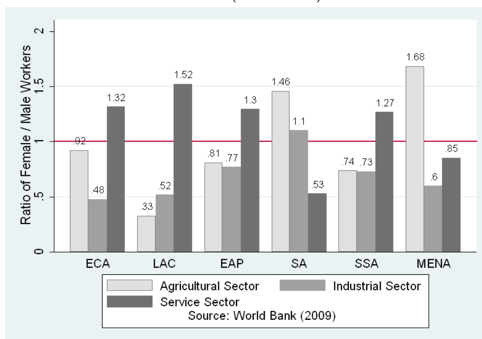
Figure 1. Gender Segregation by Sectors in Relative Ratios (unweighted regional averages) (Ø 2003-2007)

Figure 1 reveals that in all regions except South Asia, women are largely underrepresented in industry. The exception of South Asia is related to the importance of export-oriented textile manufacturing in some South Asian countries with a very high proportion of women in textile.